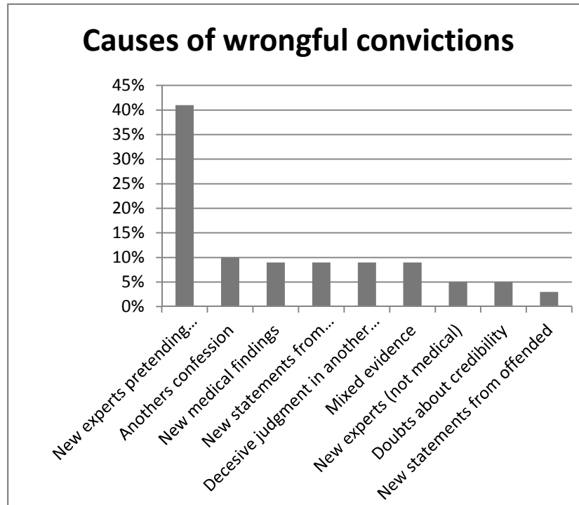
FIGURE 2. CAUSES OF WRONGFUL CONVICTIONS 2004-2009, N=58 47